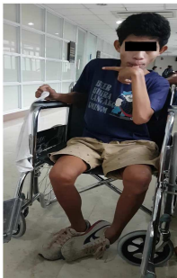
Figure 1. Image of the patient 3 months after super refractory seizure. He is wheelchair borne with left hemiparesis, left facial asymmetry, muscle wasting and generalized spasticity.

dysarthria, cognitive delay and recurrent seizures occurring twice daily. He was able to go to school with minimal supervision from his family for hygiene and safety. Since then neither medical consult provided, nor medications given, thereafter, until he had repeated seizure at the age of 16. He was brought to a neurologist where levetiracetam and valproic acid 500mg each given once daily. Neuro-diagnostics such as electroencephalogram (EEG) and cranial CT scan were done then had declining bouts. EEG result was lost while plain cranial CT scan revealed right cerebral hemiatrophy, ipsilateral dilatation of lateral ventricle, right frontal sinus hyperpneumatization and ipsilateral thickening of cranial vault. A year after, he developed super-refractory status epilepticus hence admitted under critical care service.